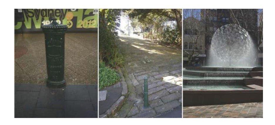
Figure 3.XX Significant public domain elements: Ward boundary marker, Cardigan Street and El Alamein fountain